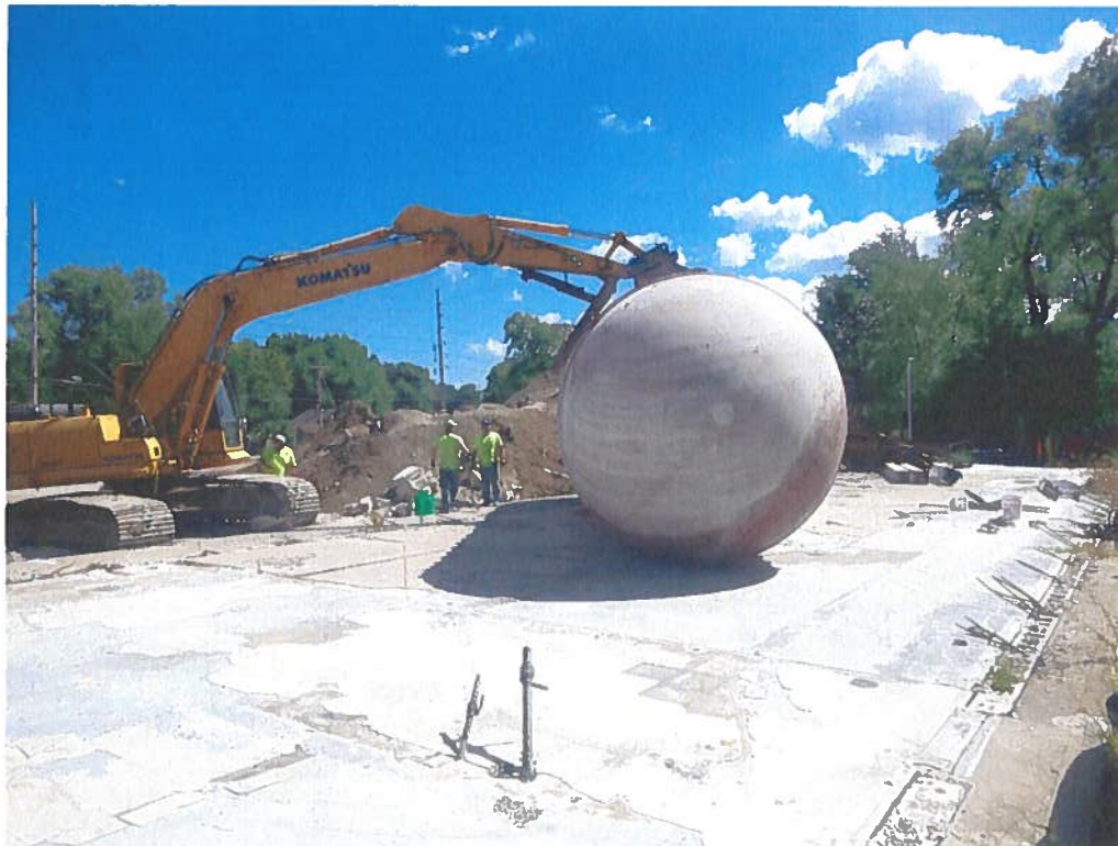
Date: 8/30/2022 Time: 2:27pm Direction: SSE Exposure #: 006 Comments: First UST set out and ready for cleaning.