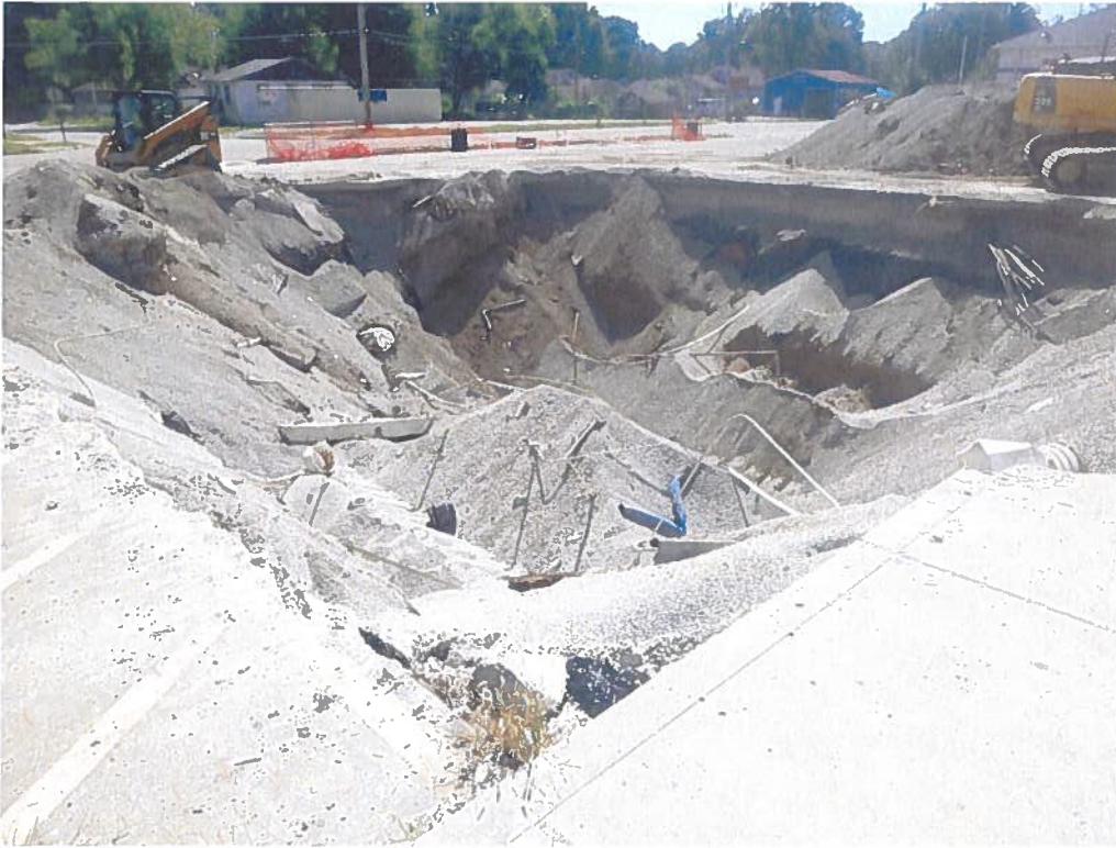
Date: 8/31/2022 Time: 11:18am Direction: NE Exposure #: 013 Comments: Tank field with both UST's removed