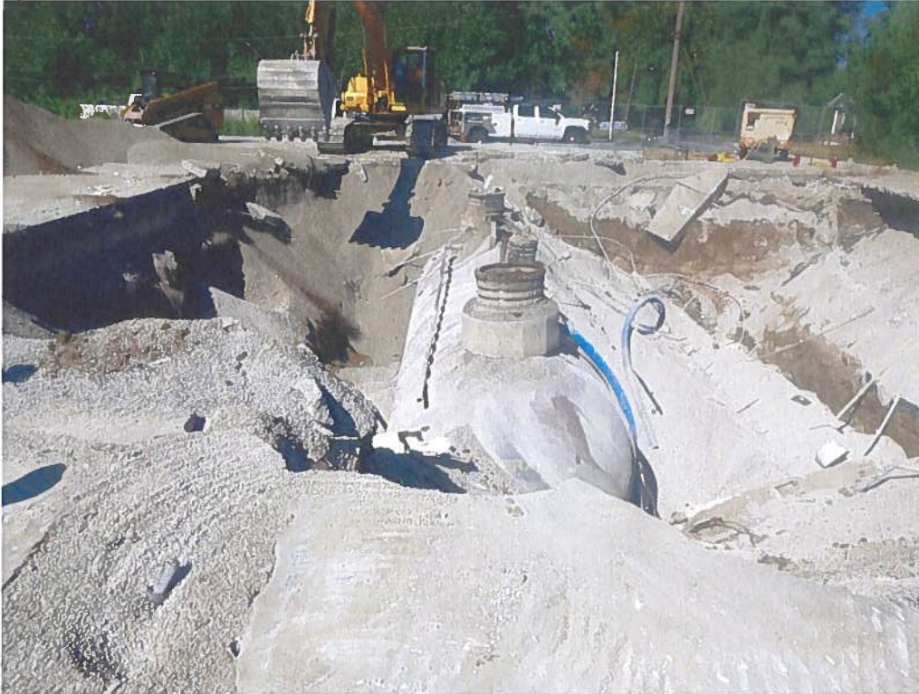
Date: 8/31/2022 Time: 10:32am Direction: W Exposure #: 011 Comments: Getting closer to removing UST.