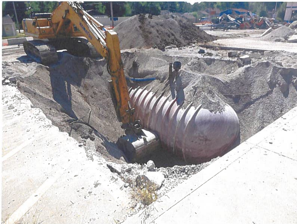
Date: 8/30/2022 Time: 10:52am Direction: SE Exposure #: 004 Comments: Beginning to uncover UST's.