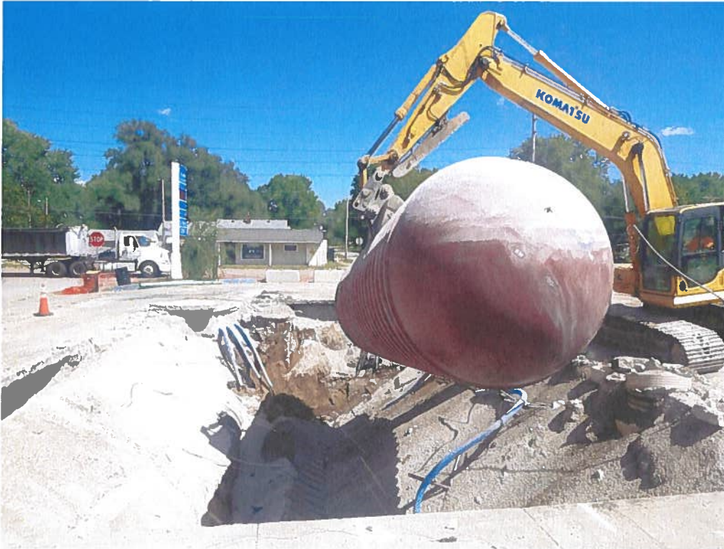
Date: 8/30/2022 Time: 2:25pm Direction: E Exposure #: 005 Comments: Removing first 20K UST.