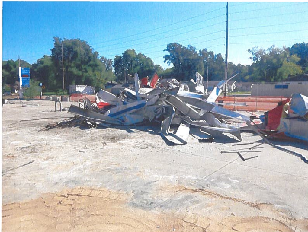
Date: 8/30/2022 Time: 9:47am Direction: NE Exposure #: 002 Comments: Remains of station to be recycled