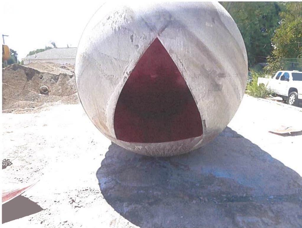
Date: 8/31/2022 Time: 11:52am Direction: S Exposure #: 014 Comments: Second UST cut open on north and south ends.