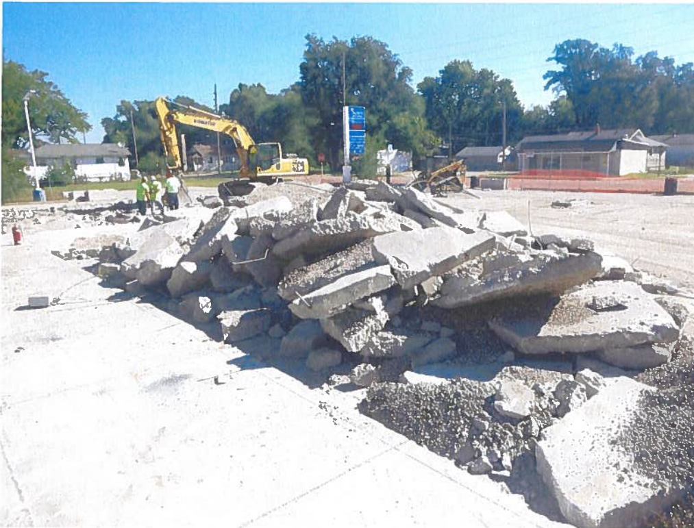
Date: 8/30/2022 Time: 9:47am Direction: Exposure #: 003 Comments: Concrete that covered tank field.