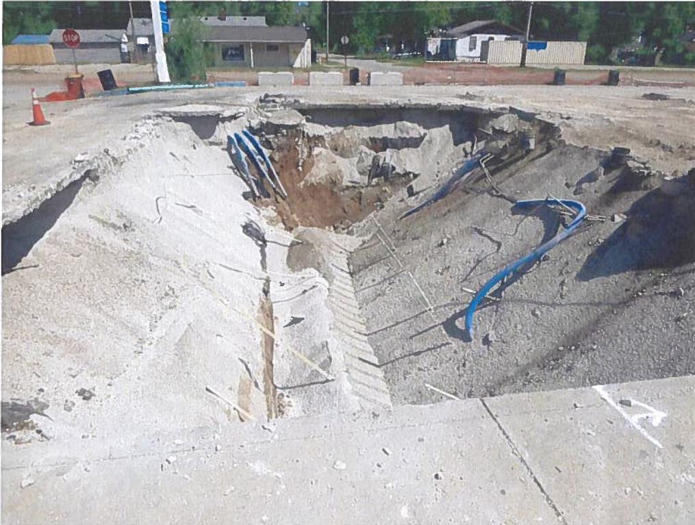
Date: 8/30/2022 Time: 2:28pm Direction: E Exposure #: 007 Comments: Tank field with first UST removed.