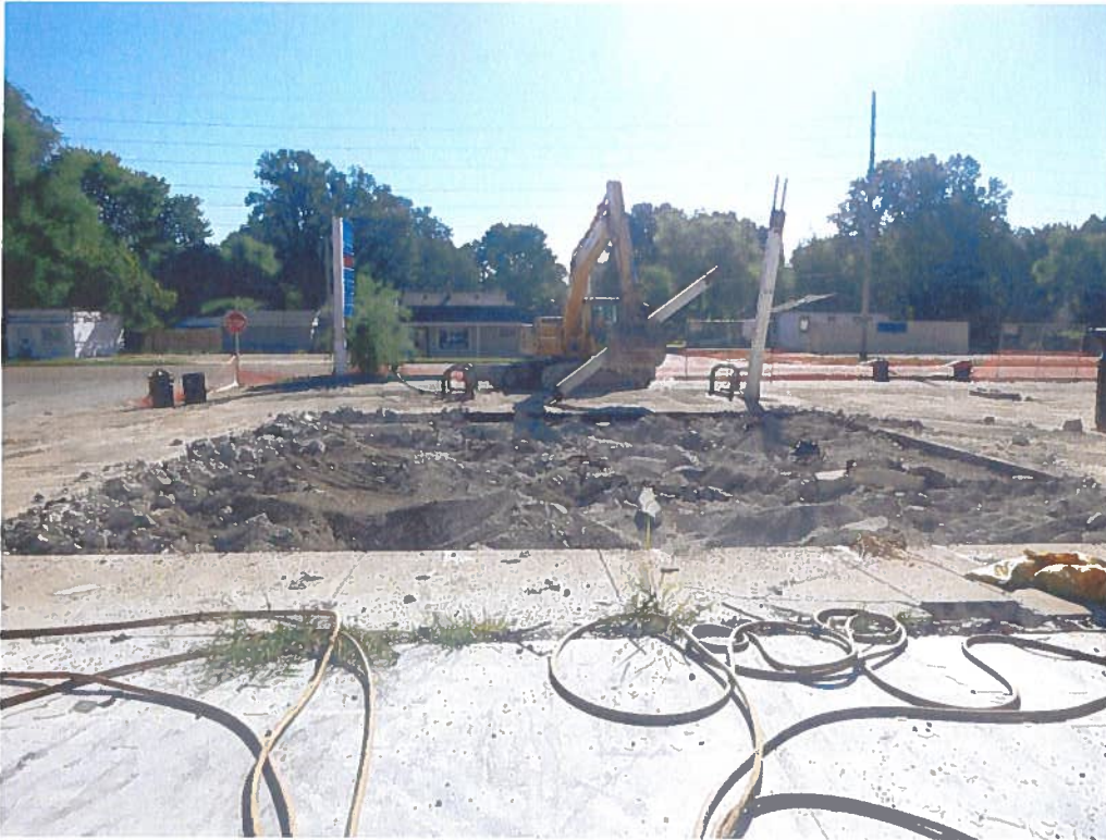
Date: 8/30/2022 Time: 9:29am Direction: E Exposure #: 001 Comments: Tank field being uncovered for tank removal.

File Names: 1631455083 ~ 08302022-[Exp. #].jpg