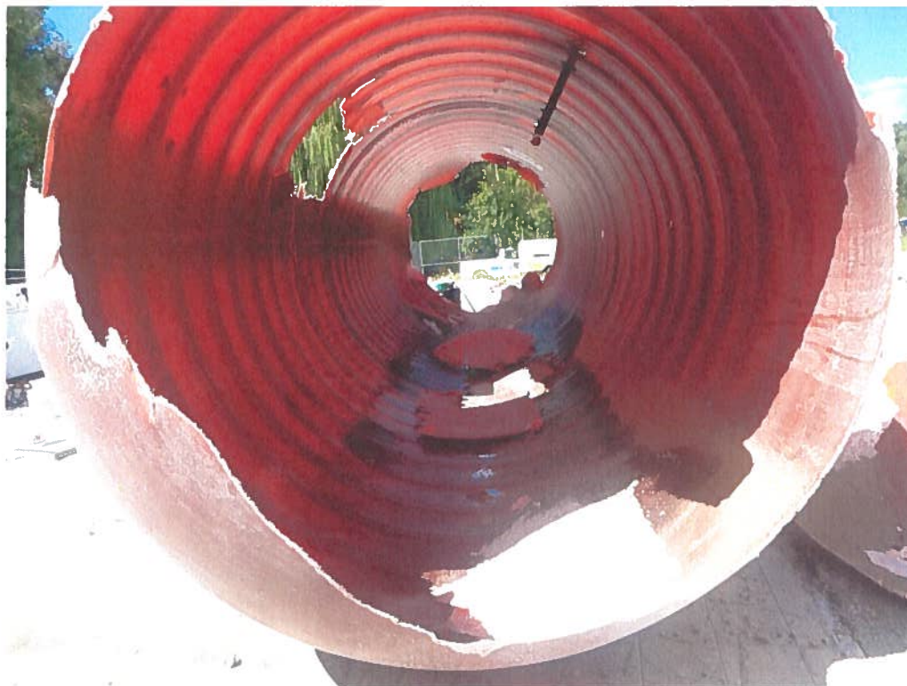
Date: 8/30/2022 Time: 2:39pm Direction: N Exposure #: 08 Comments: Cleaned interior of first UST.