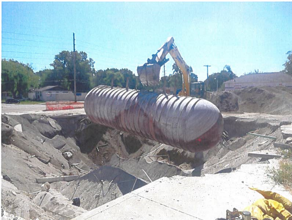
Date: 8/31/2022 Time: 11:18am Direction: SE Exposure #: 012 Comments: Removing second UST from tank field.